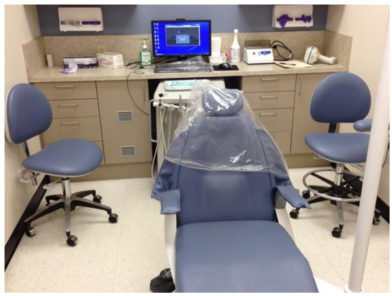
Copyright 2014 Scripps Media, Inc. All rights reserved. This material may not be published, broadcast, rewritten, or redistributed.